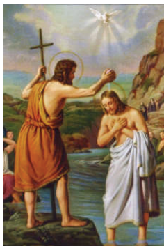
Baptism of our Lord